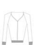
BL3203 LS button front cardigan