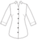
B405 Basic 3/4 slv stripe shirt