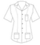
N110 SS tunic with buttons & pockets