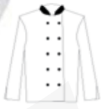
JK0033 Unisex chef jkt