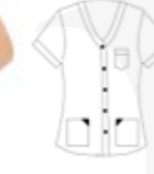
N2024 SS V-neck tunic with buttons & pockets