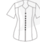
B1138 SS tunic with buttons & pockets