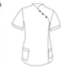
BL3049 SS tunic with Chinese collar and pockets