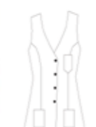
BL1164 V-neck gilet with buttons & pockets