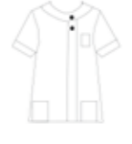
N2013 SS R-neck tunic with buttons & pockets