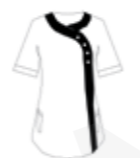
N190 SS R-neck contrast tunic with pockets