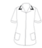
N401 SS tunic with tipped contrast, pockets & zip