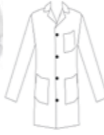
N2006 Unisex lab coat