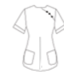
BL3047 SS R-neck tunic with pockets