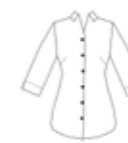
B405 Basic 3/4 slv ptd koshibo shirt