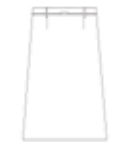
C238 Pencil skirt knee length with belt